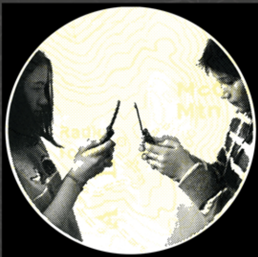
Laura Gunnip, "Signal" photo polymer emboss with screen print, 8.5 inches x 8.5 inches