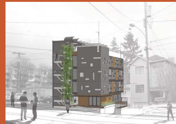
A Rendering of the Family Pack Project

Stacks of modular units, creative carving of pre-fab boxes, infusion of the built environment with greenery, all contribute to the innovative approach of the FamilyPack! Take a small urban lot zoned for density, add a devoted set of friends (4 couples) – a modern urban family – sprinkle liberally with self sustaining green strategies. Blanket the façade with a living machine - for plants and water processing, flanked by a living volume – a work/live/play box marking the entry of the building and you have the FamilyPack! Follow through with four flats assembled via modular fabrication – one for each couple. Cap the whole thing with an undulating roof garden whose floral displays include solar panels, rain collectors and wind mills. Wrap with a great urban vista and you have the FamilyPack! This vision imagines accessible housing that embraces urbanity while living lightly on the earth.